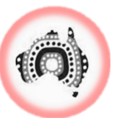
9000 artefacts found