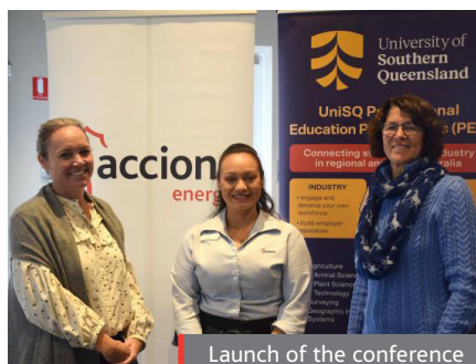
Launch of the conference

The first Employment Centric Connectivity Conference was recently held by ACCIONA Energía. This event marked the beginning of a knowledge-sharing programme that will support economic activity by bringing together