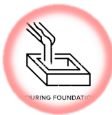
92 WTG foundations poured