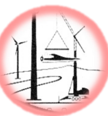
3x WTGs are currently being built