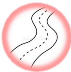
34% (70kms) track completed