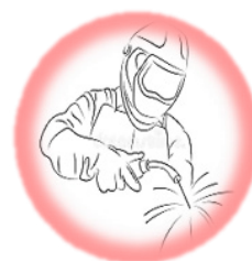
7,400 tonne of reo installed