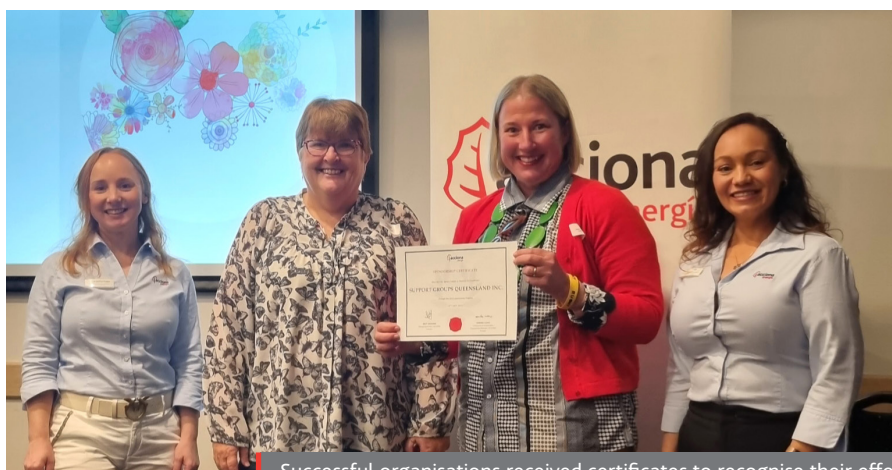
Successful organisations received certificates to recognise their efforts

Some successful recipients of the 2023 program are listed below: