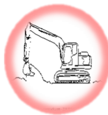
89 WTG foundations