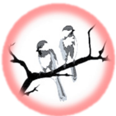
376 relocated 37,600 prickly pear treated