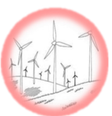
41 WTG installed but not connected