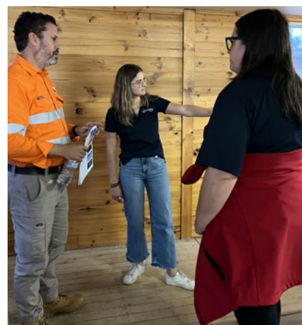
Information sessions and site tour of Herries Range Wind Farm