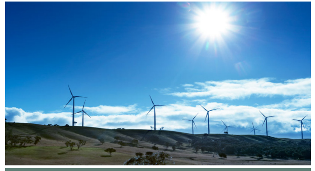
Gunning Wind Farm