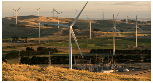
Waubra Wind Farm