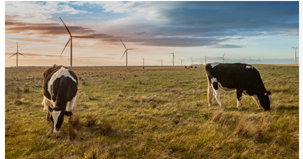
Mt Gellibrand Wind Farm