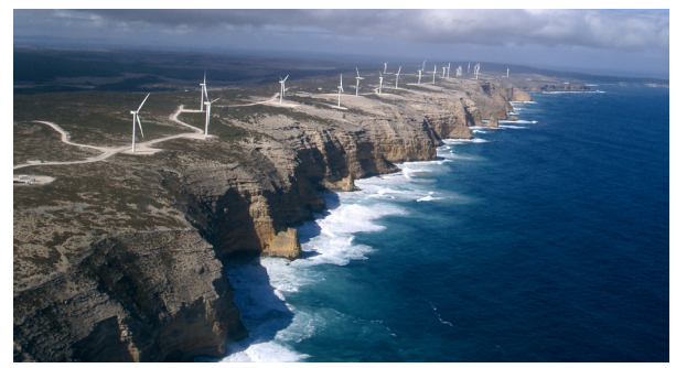
Cathedral Rocks Wind Farm