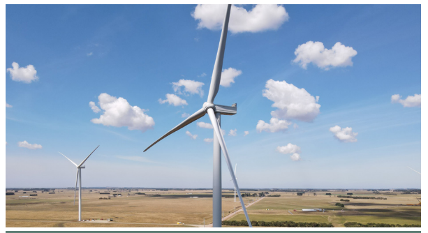
Mortlake South Wind Farm