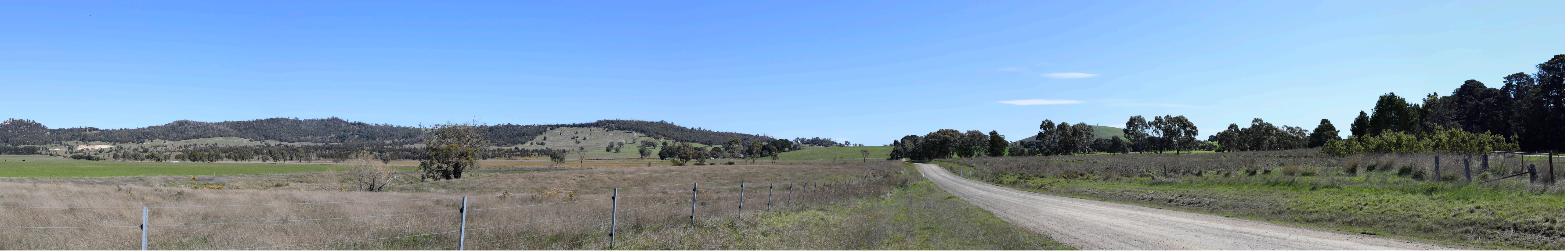
NWF-VP05 Existing view