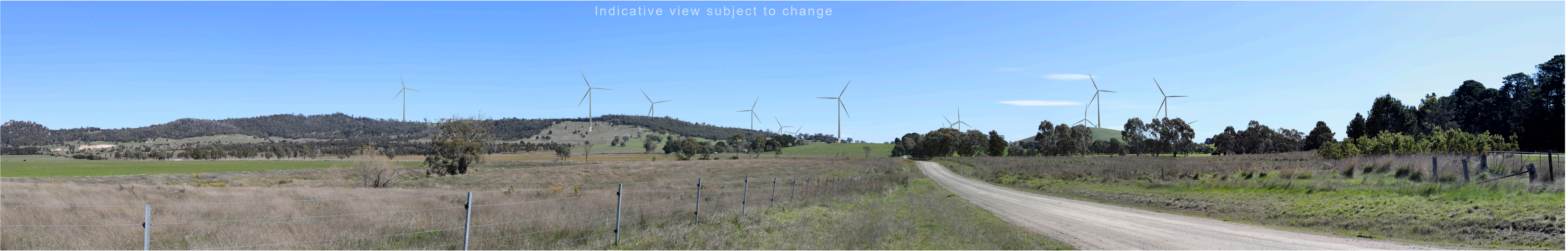
NWF-VP05 Indicative view