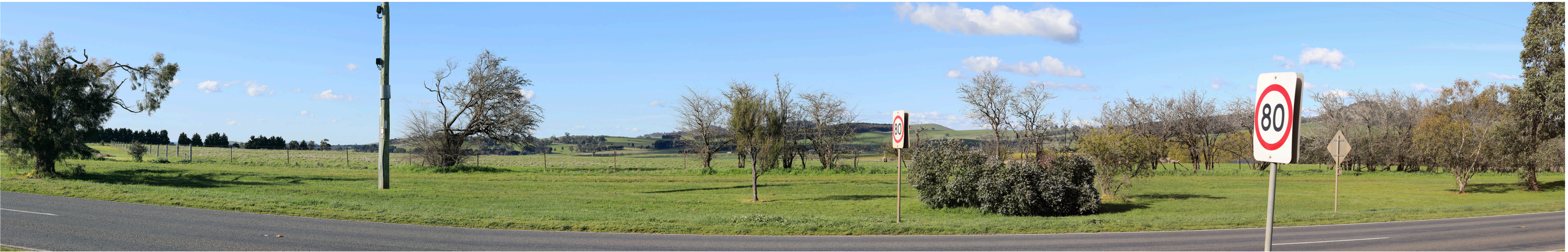
NWF-VP04 Existing view