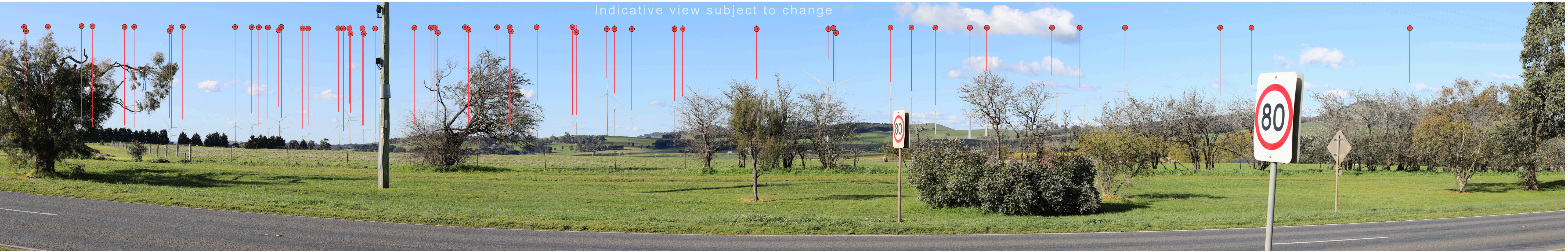
NWF-VP04 Indicative view with wind turbines highlighted in red