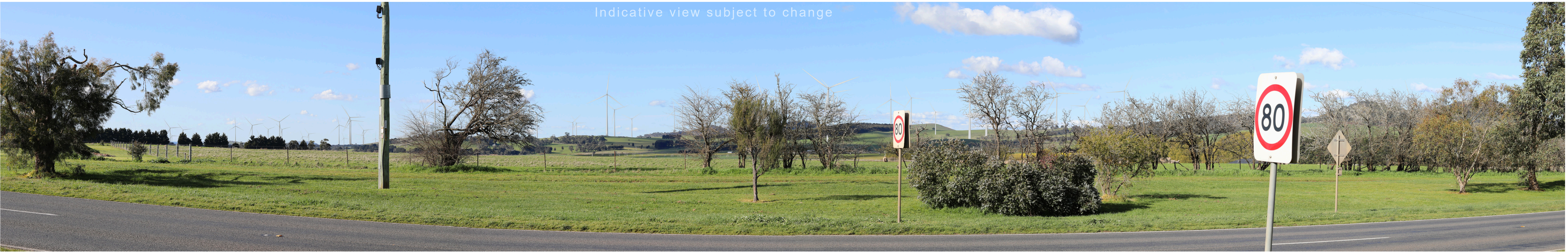
NWF-VP04 Indicative view