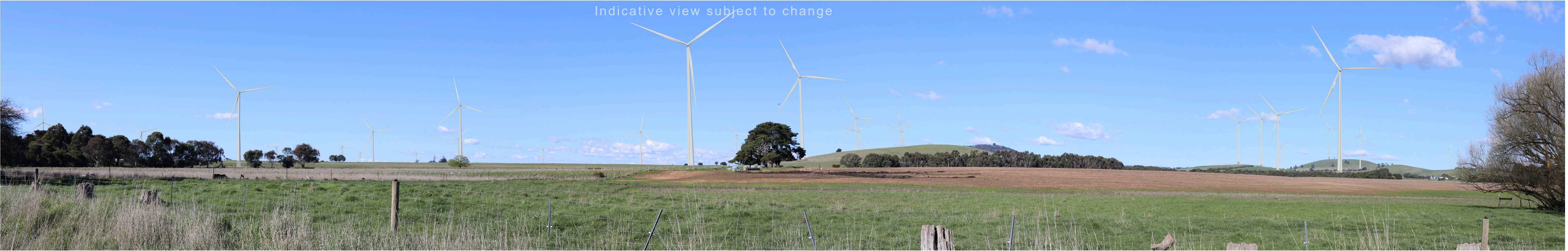
NWF-VP03 Indicative view