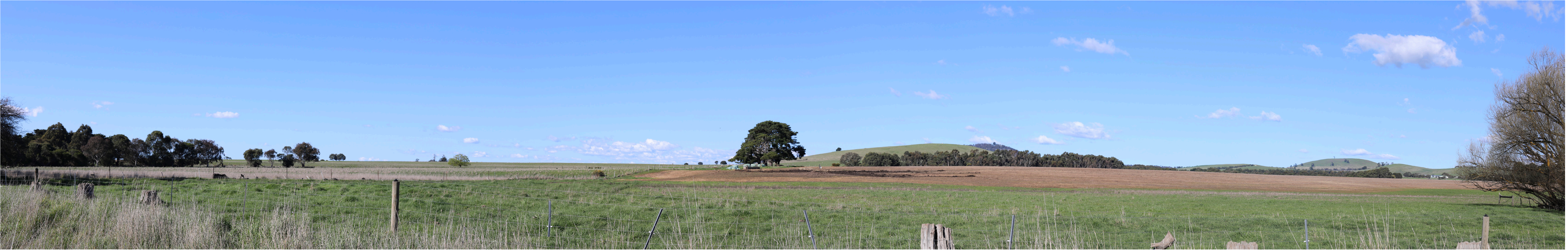
NWF-VP03 Existing view