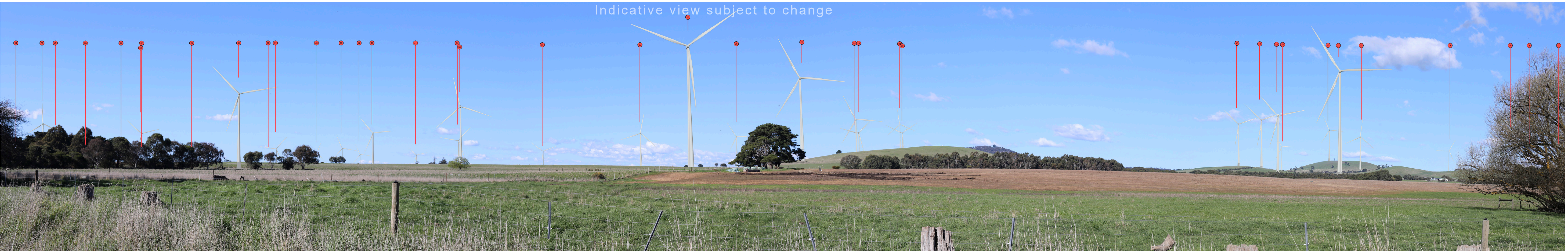
NWF-VP03 Indicative view with wind turbines highlighted in red